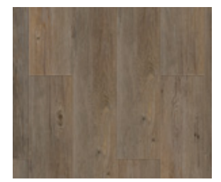
0359 WILD OAK