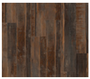
0799 TOASTED WOOD CAFE*