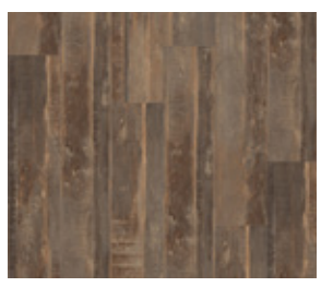
0800 TOASTED WOOD ROADSTER*