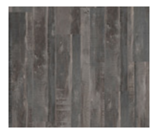
1053 TOASTED WOOD ASH*