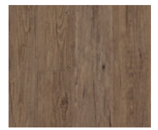
0360 DEEP FOREST