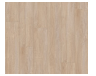
0798 CERVINO OAK NATURE*